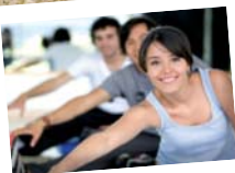
over 90 classes per week